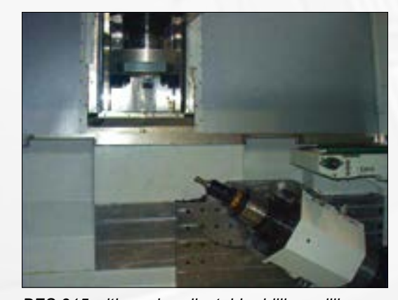
DZS 315 with angle-adjustable drilling-milling spindle