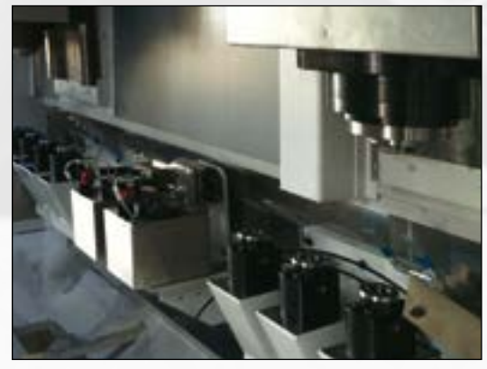
DZS 125-2 with 2 x 3 block tools, turning station and finished part slide