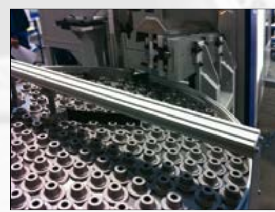
Plate storage for raw parts and telescopic slide with manipulator