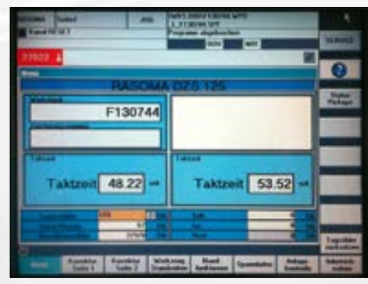
Si 840D-sl with Rasoma screen