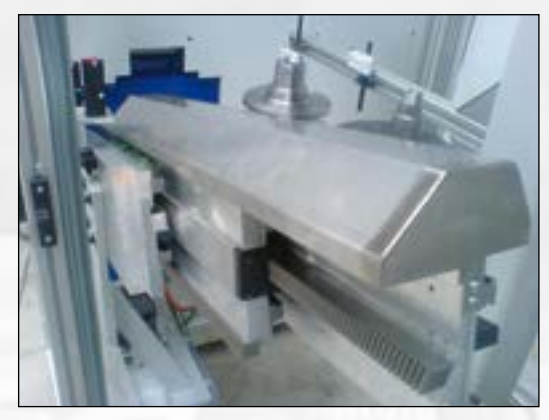
RASOMA telescopic slide for feeding and removal of parts