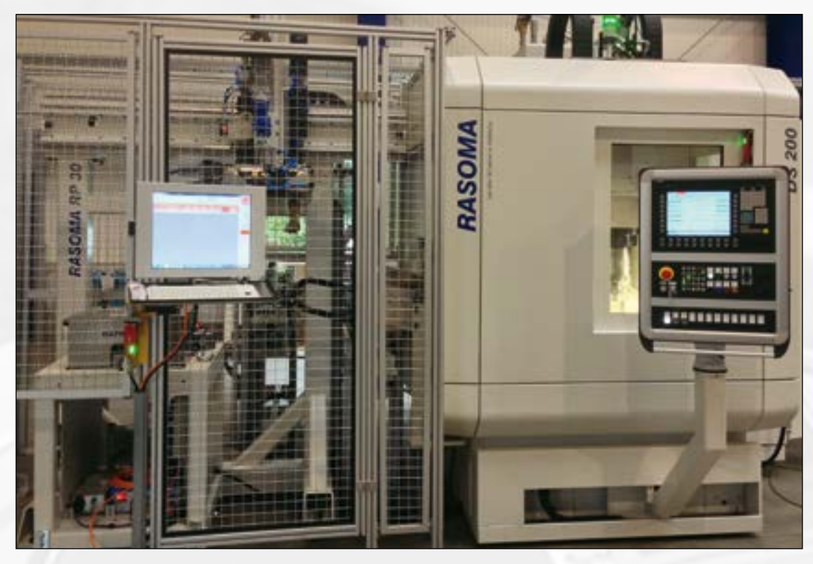
DS 200 with feed and discharge conveyor of work pieces, RASOMA portal RP 30 and external measuring station (coloring as per specification sheet)