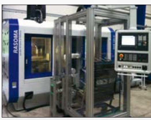
Articulated robot for loading/unloading and feeding of the measuring station, SPC slide and stacking mandrel storage of finish parts