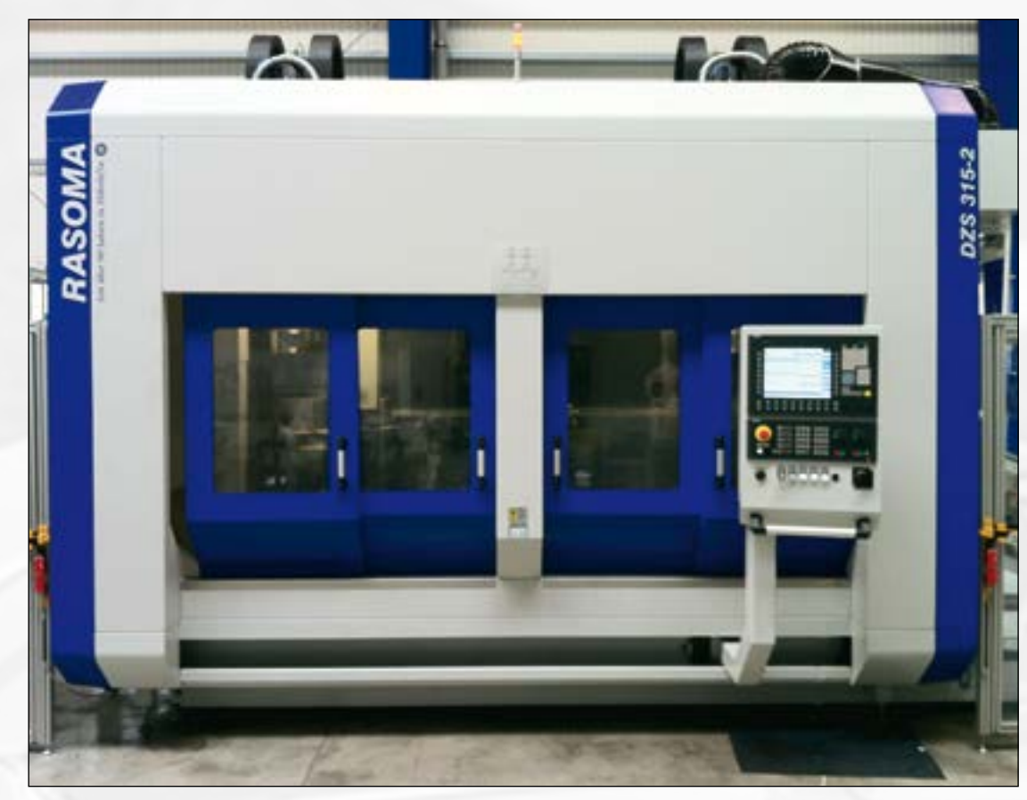
DZS 315-2 with 2 drilling-milling processing stations and 12-fold turret VDI 50