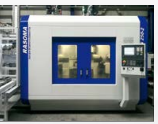
DZS 250-2 with two motor spindles, two compound slides and two 12-fold star turrets for simultaneous processing of OP 10 and OP 20