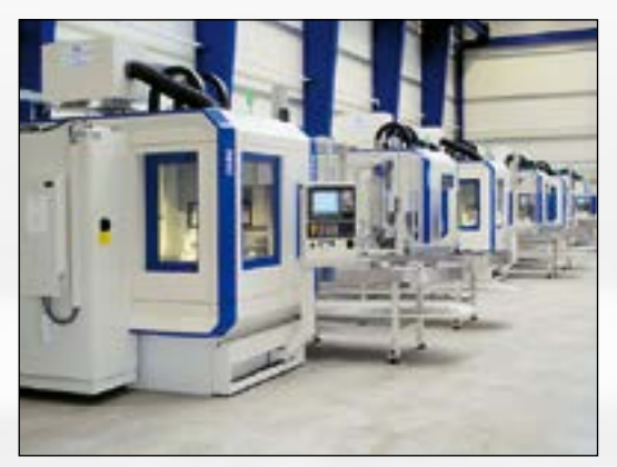
10 DS 250 machines with oval storage, lined up in pairs, for semiautomatic machining of gear wheels for commercial vehicles before and after heat-treating